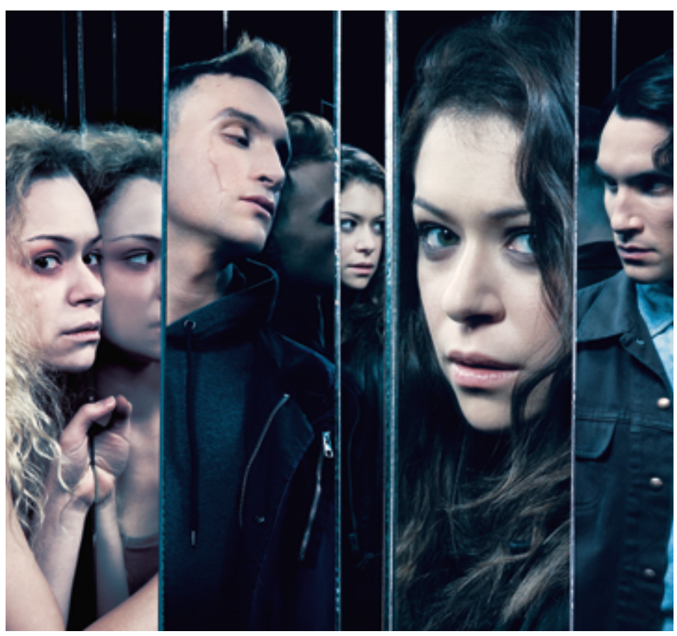
Orphan Black Series 3

Many viewers – of all ages – want intense experiences and deep engagement with a scripted show, sometimes watching several episodes in one go. "A story doesn't always need to be told in 22 episodes just because of scheduling."