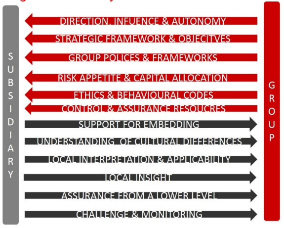
Diagram 1: Two-way flow

The key to a useful subsidiary board, which also satisfies the regulator, is to start by explicitly recognising that the local board is there because the local regulator requires it. But what exactly does the local regulator want? Essentially, it is that the board should make a positive contribution to management of the subsidiary's prudential and conduct risk. Done constructively this will also benefit the group. However, there are some areas where subsidiary boards do not have the authority of stand-alone boards. For example, subsidiary boards: