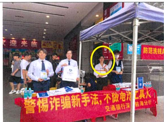
Community Service: Telecom Fraud Prevention