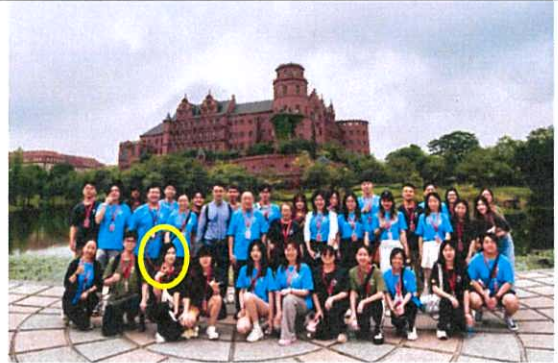
Greater Bay Area Study Tour

Following the tour, I interned at the Bank of Communications Shenzhen Branch, marking my first professional experience in mainland China. Compared to my previous internship in Hong Kong, I observed distinct workplace dynamics and culture in Shenzhen, which was an eye-opening experience. During the internship, I took part in a community initiative to raise awareness about telecom fraud prevention. Assisting elderly individuals in recognizing and avoiding scams was particularly fulfilling, as it highlighted the social responsibility of financial professionals and allowed me to apply my knowledge in a meaningful way.