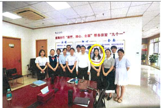
Internship at the Bank of Communications