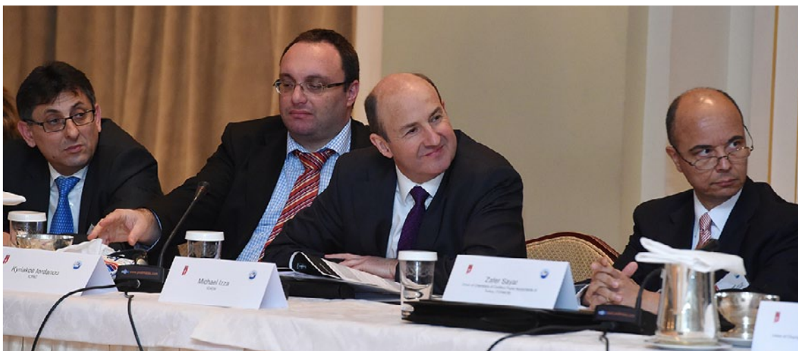
ICAEW Chief Executive, Michael Izza participating at APSF 2015

The external perception of the profession is not often sufficiently considered by PAOs: this can undermine their efficacy in many respects. The APSF could help many PAOs address these external perceptions which negatively impact on the capacity of PAOs to attract new entrants, exert influence in policy and regulatory debates and, more broadly, achieve stakeholder recognition of the key contributions which PAOs make to national economies and the public interest.