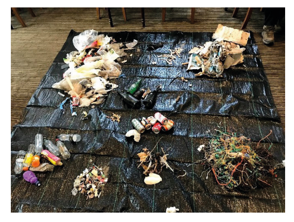
We stopped for a well-deserved lunch in the afternoon, agreeing that it had been both a fun and rewarding day out. Thank you to those that could make it, and we're looking forward to more exciting and different social events in the future!

Undeterred by various pesky plastic bags in hard-to-reach places, we worked hard and quickly amassed several bags of rubbish, contributing a huge amount to the haul, while enjoying breathtaking views on our coastal path walk.