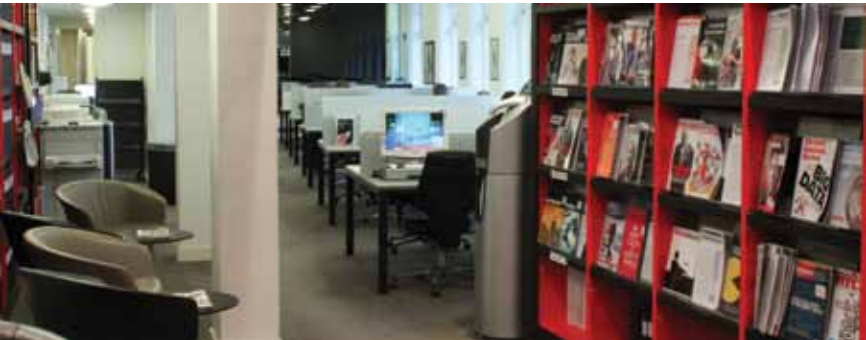
ICAEW Business Centre, Chartered Accountants’ Hall

Members also receive a 10% discount on the à la carte menu in One Moorgate Place, our award-winning restaurant available for private and professional lunches. onemoorgateplace.com/restaurant