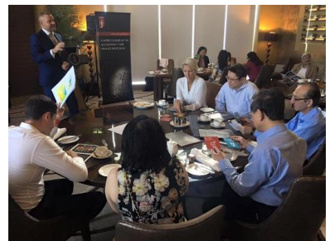
Top photos: Interactive workshop to discuss sustainable goals and its impact on individual and businesses.