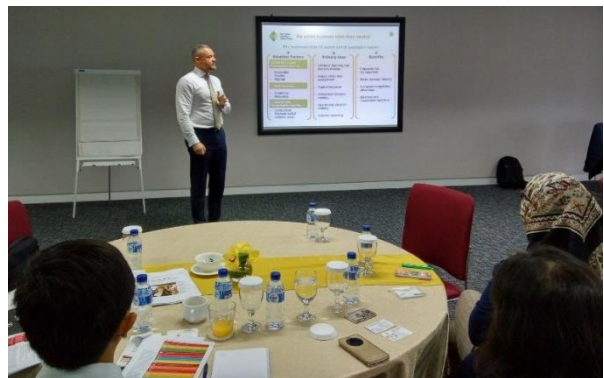
The ICAEW team at PwC