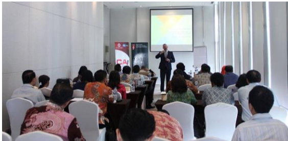
Presentation to IAI, IAPI & ICAEW members and guests

After which the ICAEW team were at PwC to hold a technical session. Both sessions covered the importance of 'Creating the policy environment to integrate natural capital into business decision-making'.