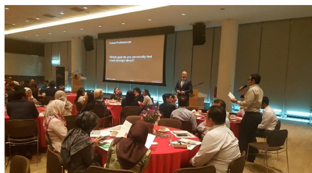
Presentation and interactive discussion with delegates at one of the events.