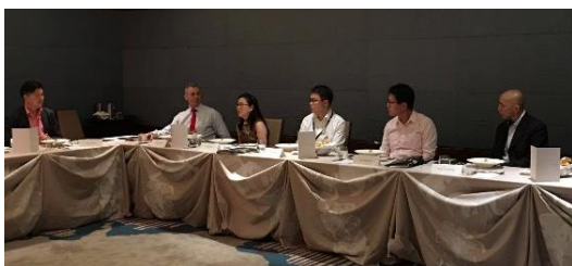
Bottom photos: Executive Roundtable discussion among senior level executives on SDG