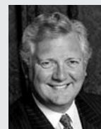
The Rt Hon Sir Jeremy Hanley KCMG FCA Former Cabinet Minister and Past Master of the Worshipful Company of Chartered Accountants in England and Wales

£2m would endow the income needed to enhance the superb Library and Information Service, as well as contributing to the heritage of the ICAEW's prestigious headquarters.